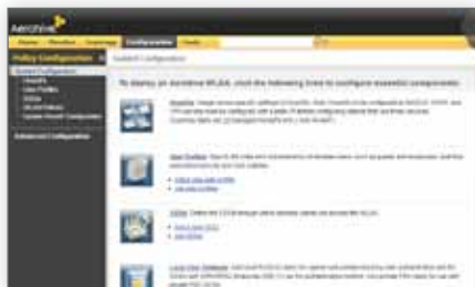
Easy guided configuration.

HiveManager Online is an enterprise-class NMS for Aerohive HiveAPs, delivered as a cloud-based service.