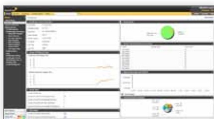
Dashboard enables real time monitoring.